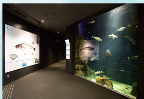
Saltwater fish zone