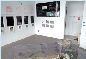
Marine debris display