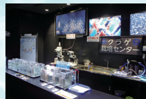
Jellyfish Commentary Corner