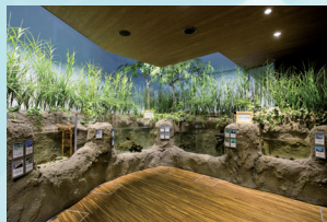
Freshwater fish zone

Encounter a variety of freshwater and saltwater fish from the Shonai rivers, lakes and coastal waters. Learn also about prevention of marine debris at a special information corner.